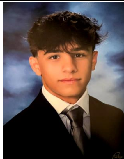
A portrait of a young man with dark, wavy hair, smiling slightly. He is wearing a dark suit jacket, a white collared shirt, and a dark tie. The background is a mottled, light-colored studio backdrop.